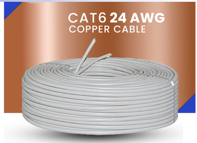
CAT6 24 AWG COPPER CABLE